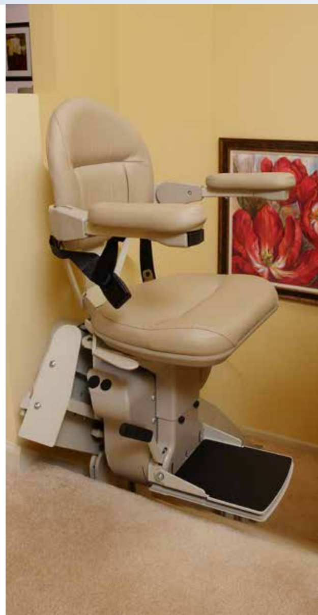
Luxury styling and comfort.

“Green Bay Packers Hall of Fame Quarterback”