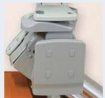
Power folding footrest automatically flips up/down when seat is raised/lowered. Arm switch control optional.