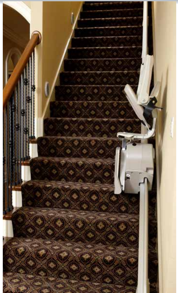
Compact, flip-up design for plenty of open space on stairway.

“Staff was very professional and helpful. The chair is wonderful and I will recommend the product and company.”