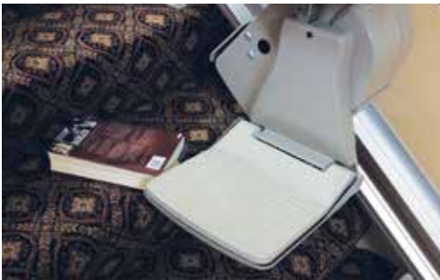
Sensors ensure safety.