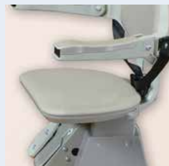
Power swivel seat for effortless exit. Armrest switch control or wireless call/send.