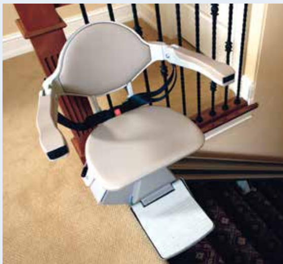
Padded, generous seat.