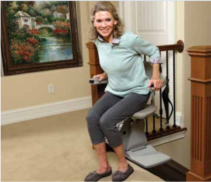
Offset swivel seat makes getting on/off easy.