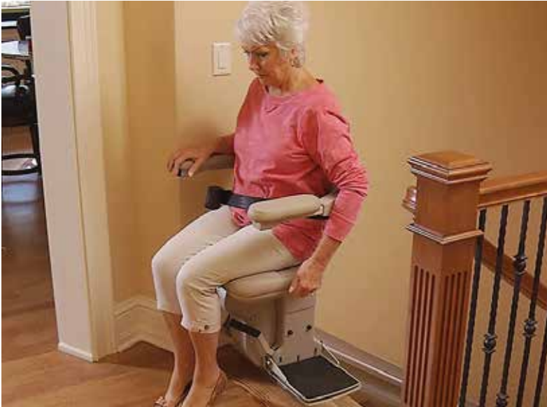
Offset swivel seat makes it easy to get on/off.

“The Bruno stairlift has eliminated an enormous amount of anxiety and stress. We feel grateful for it every day.”