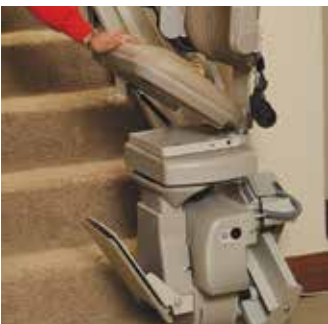
Power folding footrest automatically flips up/down when seat is raised/ lowered.