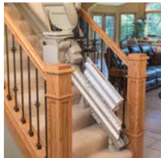
Power or manual folding rails for narrow hallway or when doorway is at the bottom of stairs. Manual operation or push button automatic.