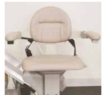
Larger seat and footrest for increased comfort.