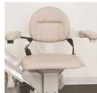
Larger seat and/or footrest for increased comfort.