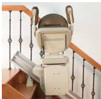
Power folding footrest automatically flips up/down when seat is raised/ lowered.